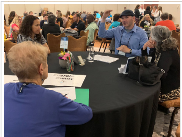
Advancing IIS together

The IIS community also described the new stakeholders they are currently recruiting or hope to recruit to champion their IIS. IIS attendees are currently recruiting or plan to recruit pharmacies, schools and universities, legislators, immunization coalitions, local chapters of the American Academy of Pediatrics, pediatric and adult providers, correctional facilities, urgent care networks, insurers and health plans, EHRs,