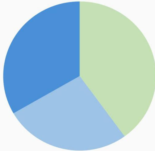
Distribution by Validated Content Areas — 2025 (After)

■ 5 Content Area ■ 4 Content Areas ■ 3 Content Areas